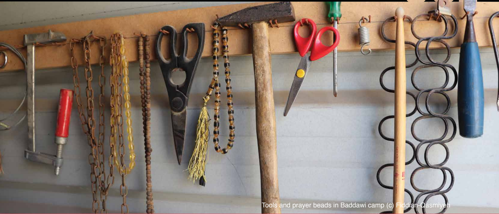
Tools and prayer beads in Baddawi camp