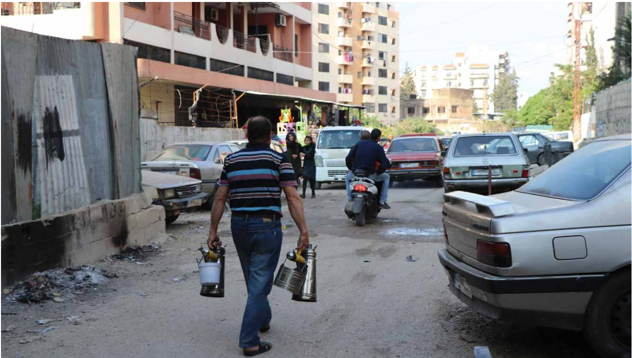
A Syrian coffee vendor on the outskirts of Baddawi camp

the first two sections of the report challenge us to think beyond narratives that interpret faith in contexts of displacement as something to be mistrusted, leading only to negative outcomes, violence or suspicion.