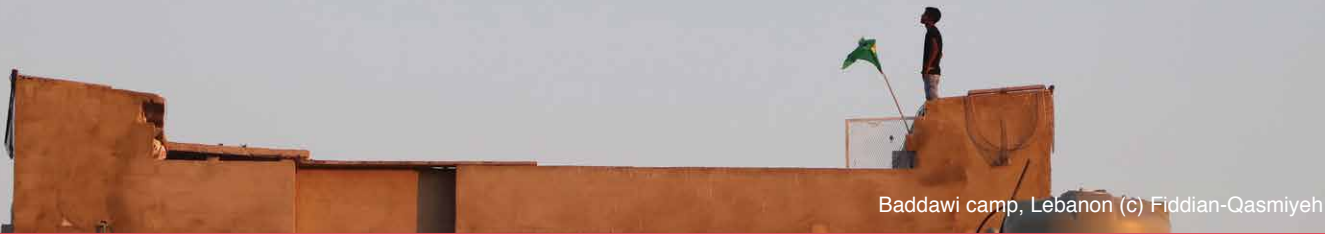
Baddawi camp, Lebanon