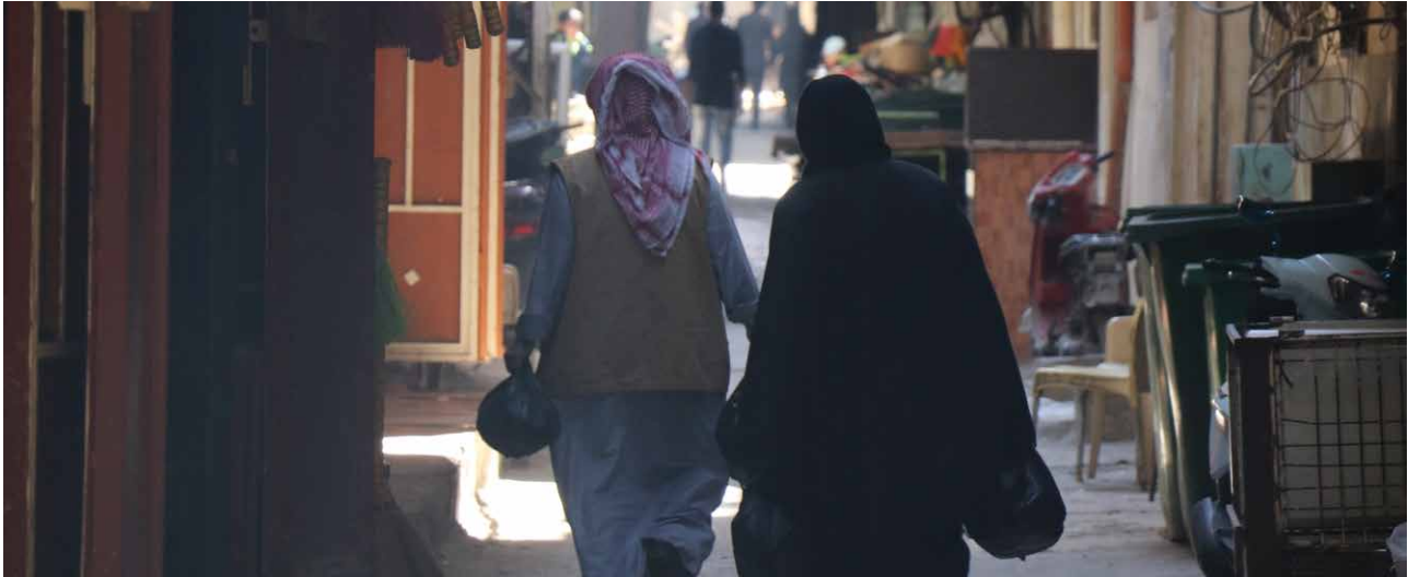
In the streets of Baddawi camp

This final section of the report turns to the complex relationship between religion, social justice and institutionalized responses to refugees through a multiscalar framework, from the local to the international.