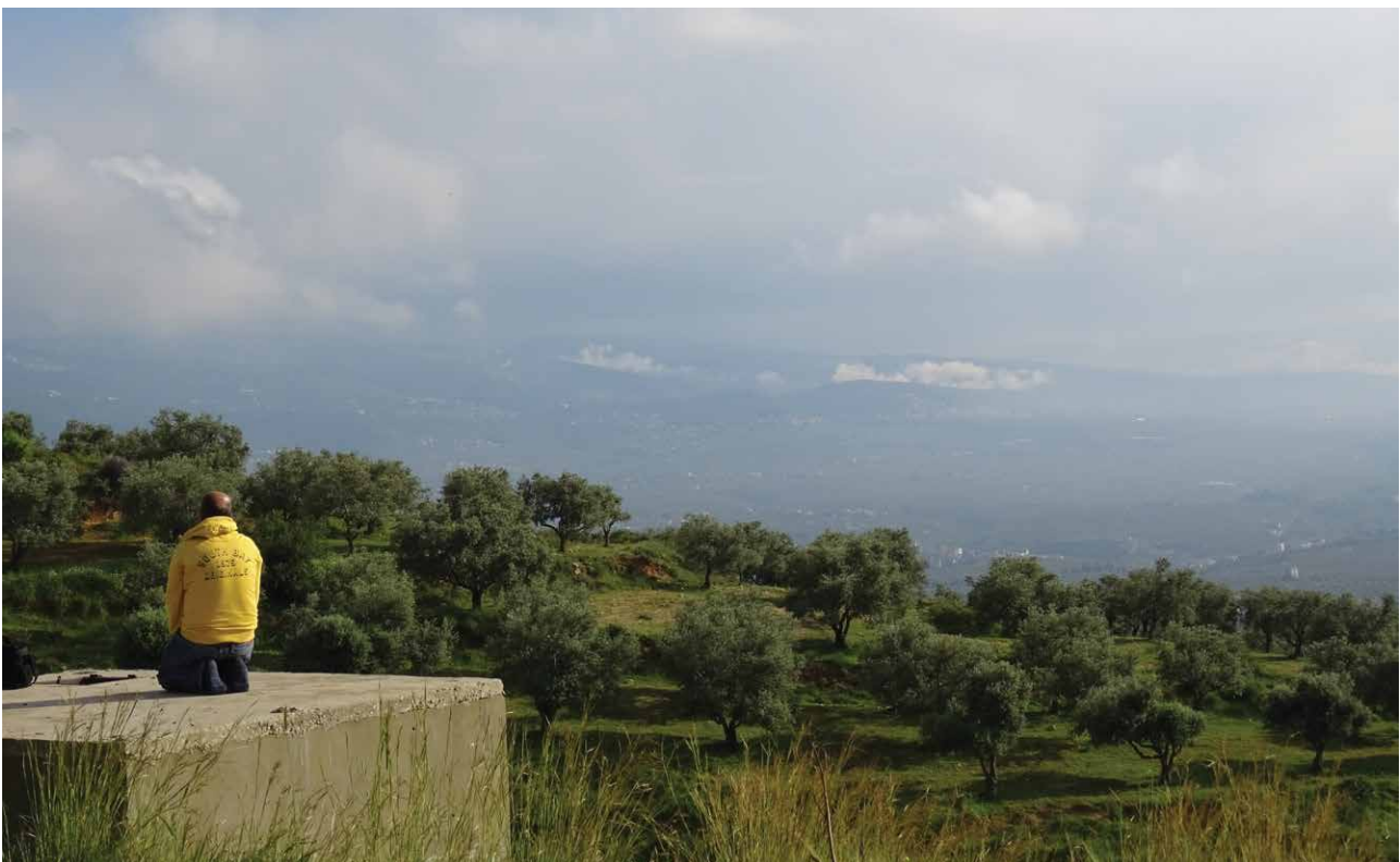
A man prays on the route to Baddawi camp

In conclusion, the multisited framework underpinning our project enabled us to identify the importance of historical and geographical specificities, whilst also highlighting diverse commonalities of experience. These commonalities point to the ways that persecution, violence and diverse forms of social injustice are linked to similar systems and structures of inequality and exploitation. These include states that not only fail to protect refugees and migrants, but also create precarity and risk across time and space. It is against this backdrop that we find non-state actors acting in ways designed to fill the gaps created by states, and seeking to hold states accountable for their responses.