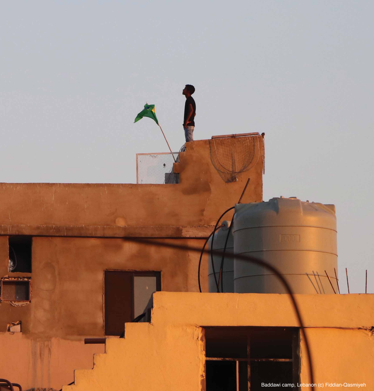
Baddawi camp, Lebanon