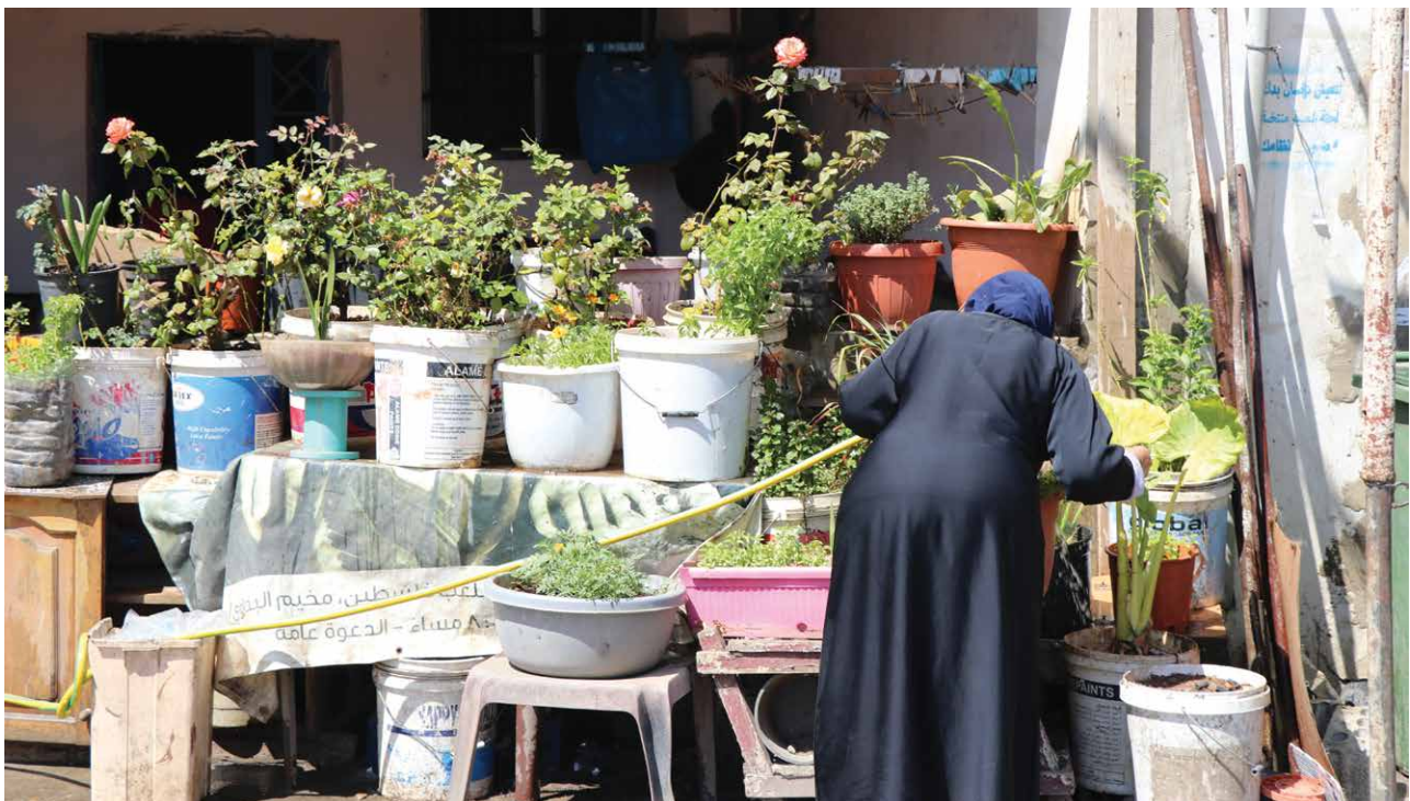
A woman waters flowers in Baddawi refugee camp, North Lebanon

Like many members of host communities and faith-based organisations, refugees themselves act to support members of their own and other communities precisely because states and international organisations are failing and refusing to do so. The invocation of depending on God emerges precisely as a direct critique of the failure of political systems. 102 Far from a fatalistic response to such conditions of manufactured precarity and restrictionism, local and transnational actors alike are creating diverse ways of conceiving