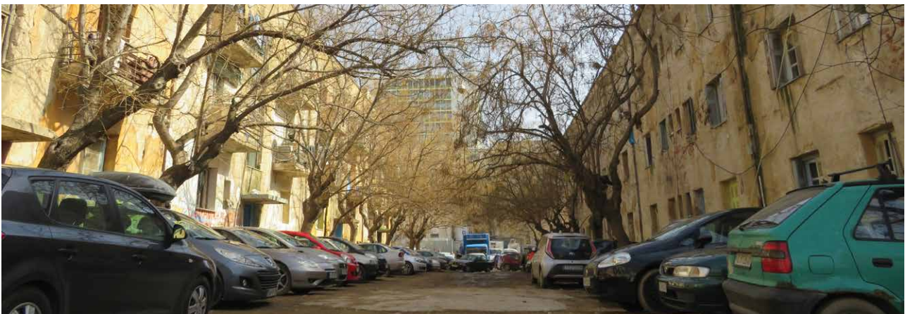
Refugee housing project from 1900s, Athens

It seeks to do so whilst recognizing the extent to which states around the world are increasingly introducing restrictions and political strategies that currently prevent many of these principles from being put into action. These restrictions and strategies range from travel bans and deportation regimes, to journalists and humanitarian workers being killed, to humanitarians and solidarians being criminalised, to the introduction of finance laws and countering violent extremism policies, all of which are having, and will continue to have, wide-ranging effects. 100