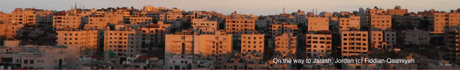
On the way to Jarash, Jordan