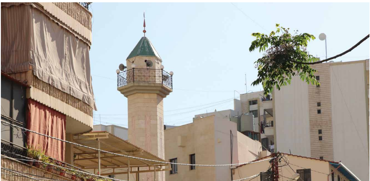
The mosque in Jebel Al-Baddawi, Lebanon

For example, the iconography of both faith-based organizations and US law enforcement groups portray a vivid humanitarian and political emergencies - as migrants cross the border, militaries enforce border security. For FBOs, solidarity lives in images on walls and in shared experiences, such as making and serving food together. For refugees and migrants, it is expressed in a shared history, through the actions of people and what is left behind: a sense of suffering and sacrifice. In contrast, law enforcement agents exhibit a different form of solidarity – one rooted in patriotism, service, and professionalism. 92 We can contrast here a religious, sacred sense of solidarity with a secular, nationalistic language of solidarity, both highlighting the need to stand together and be ready for collective action.