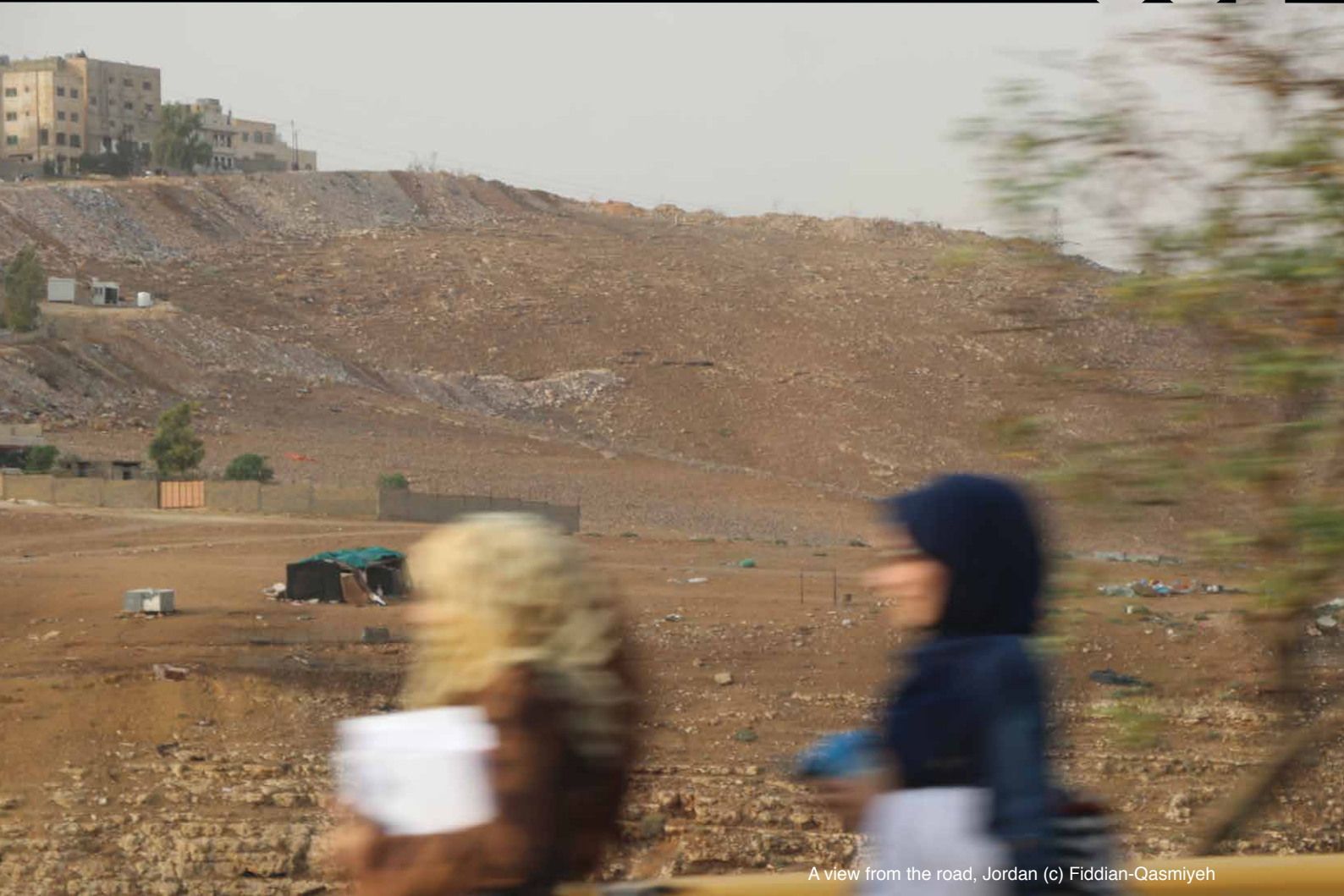
A view from the road, Jordan