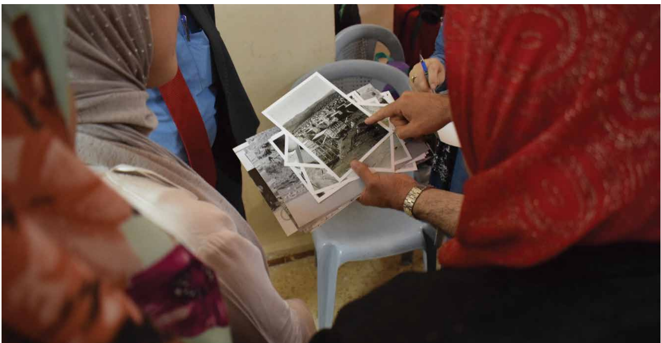
Participants attending a Refugee Hosts writing workshop, Jordan

on their nationality. On the one hand, Palestinians from Syria only receive limited assistance from UNRWA and can only access UNRWA-run educational and health services which are increasingly under-funded and under strain. 62 On the other hand, non-Palestinian refugees from Syria (including Syrians, Iraqis, Kurds) are registered with UNHCR and are entitled to a wider range of services and programmes. Most importantly for many residents in the camp, non-Palestinian refugees from Syria have the possibility of being referred by UNHCR to be resettled to a third country. Palestinian refugee families who have resided in the camp since the 1950s remain stuck in the camp, observing the different forms of assistance and possible resettlement options that are being provided to new arrivals. 63