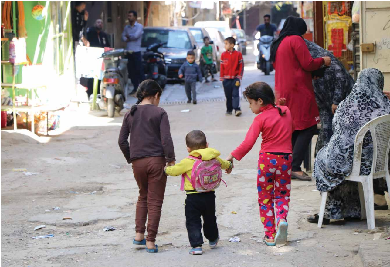
On the way to school, Baddawi refugee camp, Lebanon