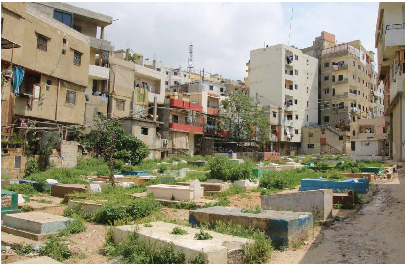
The original cemetery in Baddawi refugee camp, Lebanon

As such, this report examines the significance of religion and politics in relation to social justice for refugees and the racialization and politicization of refugees and refugee response.