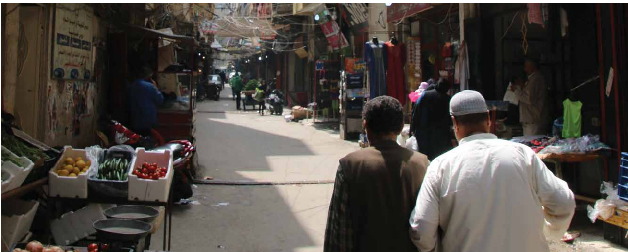
An evening stroll in Baddawi camp, Lebanon

Acknowledging, and appreciating the “significant work” undertaken by refugees and refugee-hosts must take place in conjunction with the acknowledgement of the responsibilities and duties that should be upheld by international actors, including states, UN agencies and INGOs.