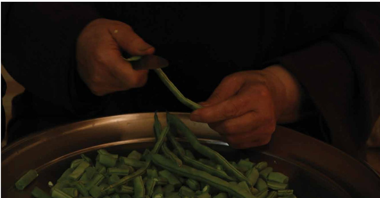
Preparing food in Baddawi camp

Indeed, a key factor emerging in such assumptions is precisely the extent to which Muslimness or religiosity is overexaggerated by external observers and becomes the overarching frame of reference, erasing recognition of not only the potential for, but reality of, solidarity across political lines.