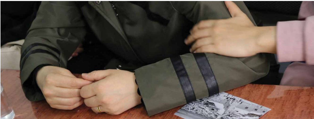
Workshop participants, Jordan