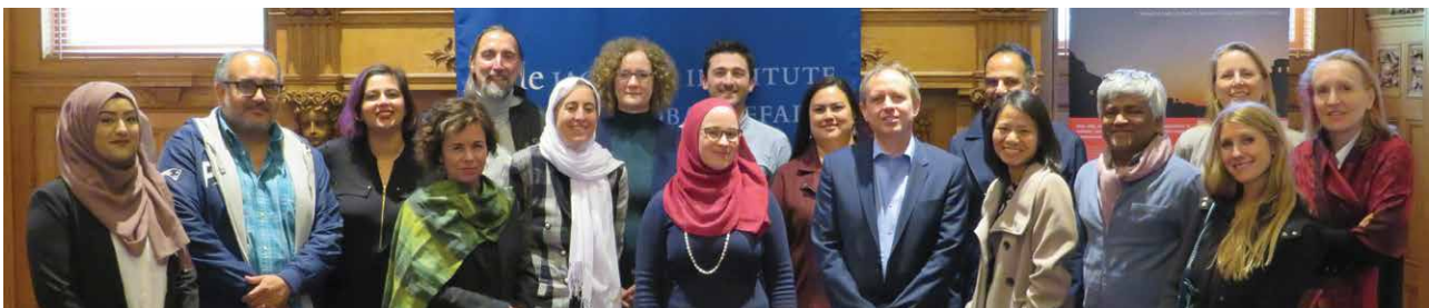
The research team and colleagues at the Bridging Voices Workshop, Yale, May 2019

The research teams experienced several challenges in the course of fieldwork which are important to acknowledge and reflect upon.