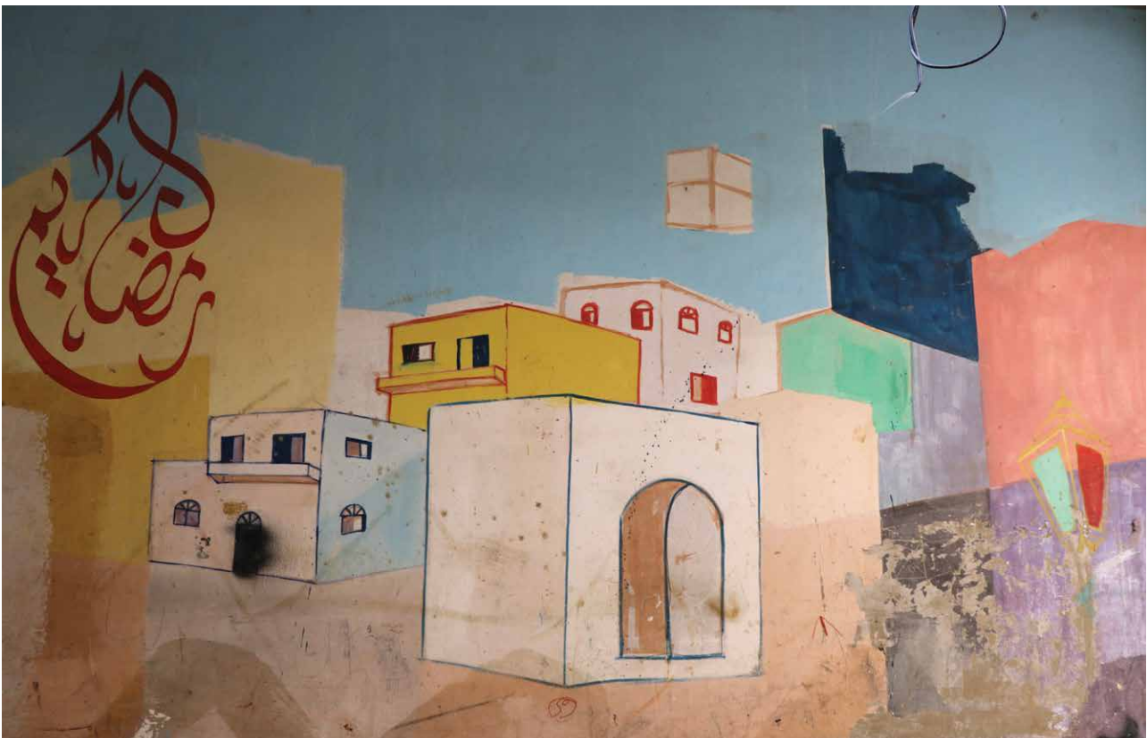
A mural in Baddawi camp wishing passersby a Ramadam Kareem